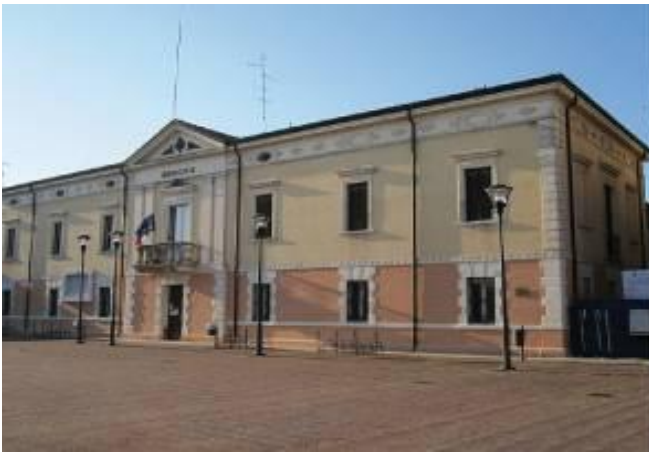
Main square and City Hall of Ostellato City

The parade will be composed of all attending teams, headed by the flag throwing men, musicians and historical characters of the town of Ferrara.