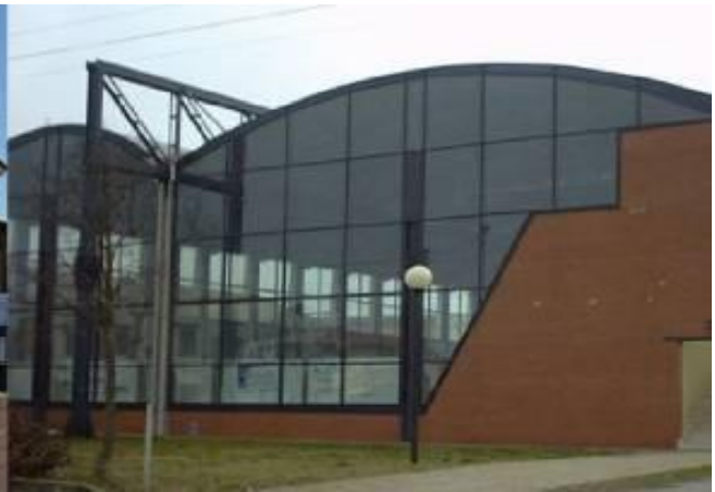
"Sports Hall"-address: 35B Strada Marcavallo Ostellato City